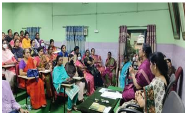
Plan of Action meeting for the Mega Job Drive