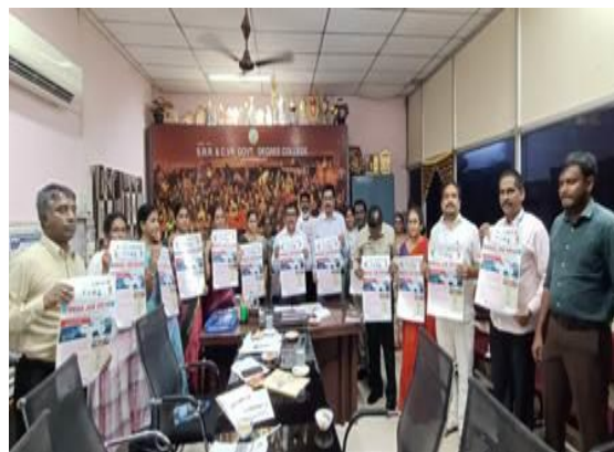
Poster Release of Job Drive