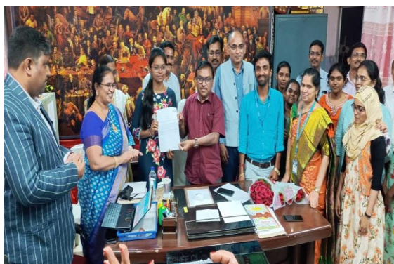
Honorable Commissioner presenting offer letters to selected candidates